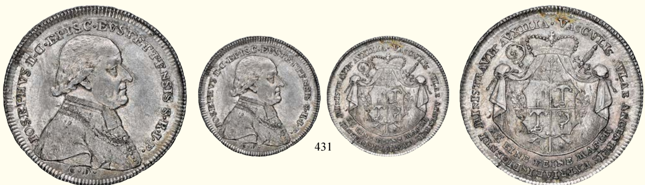
431 Eichstätt, Bistum, Joseph von Stubenberg, 1790-1802. 1/2 Taler, 1796 CD, Munich (KM96; Cahn 150). Exceptional strike and surfaces, mint state 200 Graded MS63 NGC