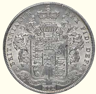
446 Halfcrown, 1826 (ESC 2375; Seaby 3809). Graded MS64 NGC