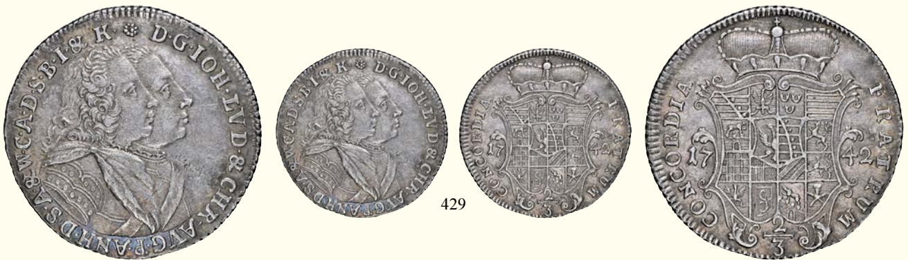
429 Anhalt-Zerbst. Johann Ludwig and Christian August, 1742-1746. 2/3 Taler, 1742, Zerbst (Dav. 206). About extremely fine, toned 200 Graded AU55 NGC