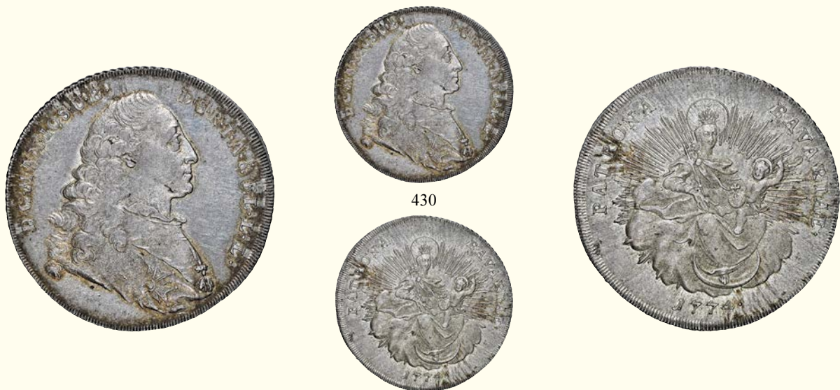
430 Bavaria, Maximilian III Joseph, 1745-1777. 1/2 Taler, 1774, Munich (Hahn 305, KM222). Extremely fine for type with underlying lustre and joint-finest graded by NGC 200 Graded MS63 NGC