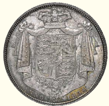
447 William IV, 1830-1837. Halfcrown, 1834, WW in script on truncation (ESC 662; Seaby 3834). Graded MS64 NGC

A coin exhibiting wonderful grey and blue toning