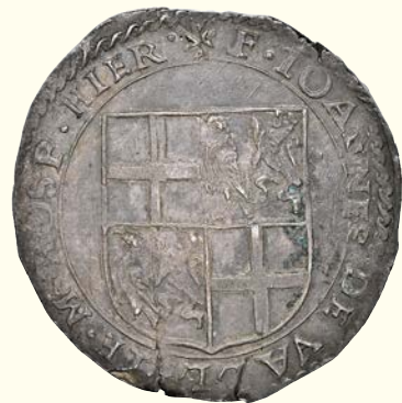
491 The Knights of St. John, Jean de Valette, Grandmaster, 1557-1568. AR 4 Tari, no date (R&S 27; Sch. 2). Strong details on severed head of Baptist with an even grey tone, extremely fine 800 Graded MS62 NGC